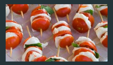
Cherry Tomato & Buffalo Mozzarella with Fresh Basil Pesto