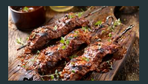
Char-grilled Steak Skewers with Grainy Mustard Dressing