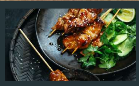
Lime & Coriander Chicken Skewers & Mint Dipping Sauce