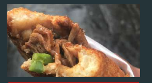
Yorkshire Pudding Wrap