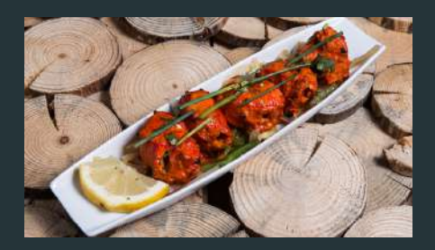
Spicy Chicken Tikka Bites with Sweet Mint & Yoghurt Dressing