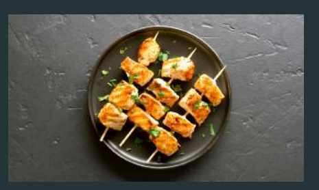
Individual Skewers of Smoked Salmon with a Sweet Mustard and Dill Sauce