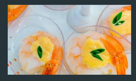
Sweet Chilli King Prawn with Wasabi Mayonnaise on Prawn Crackers