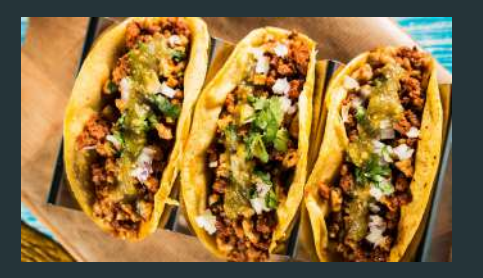
Tacos / Burritos