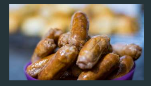
BBQ Chipolata's with Honey & Mustard Drizzle

PRICES START @ £6,95 PER HEAD For More Information Call 0151-291-1144 or Email Info@WildTruffle.co.uk