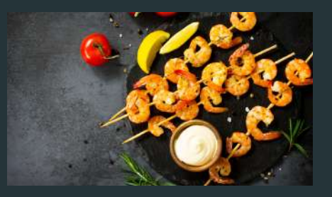
Tiger Prawns Grilled with Lomon, Garlic and Herbo served with Aioli