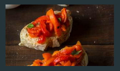
Roasted Red Pepper and Chorizo Bruschetta